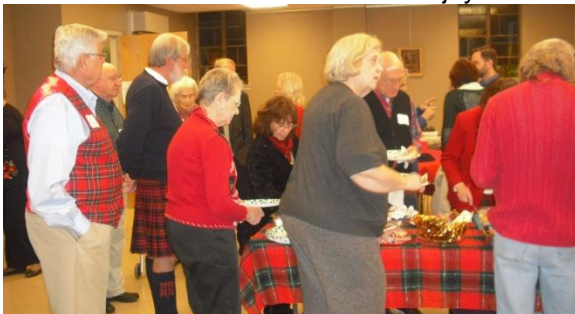
Time to eat!