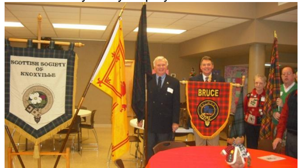
After the banners are piped in