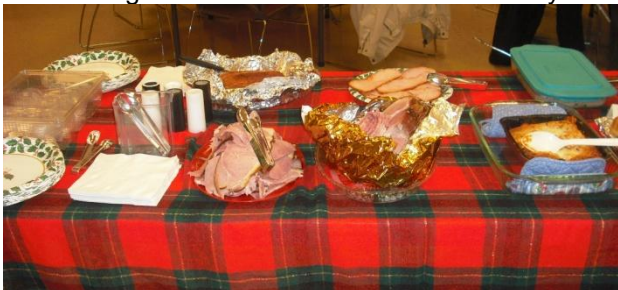
Food from and for our members to enjoy